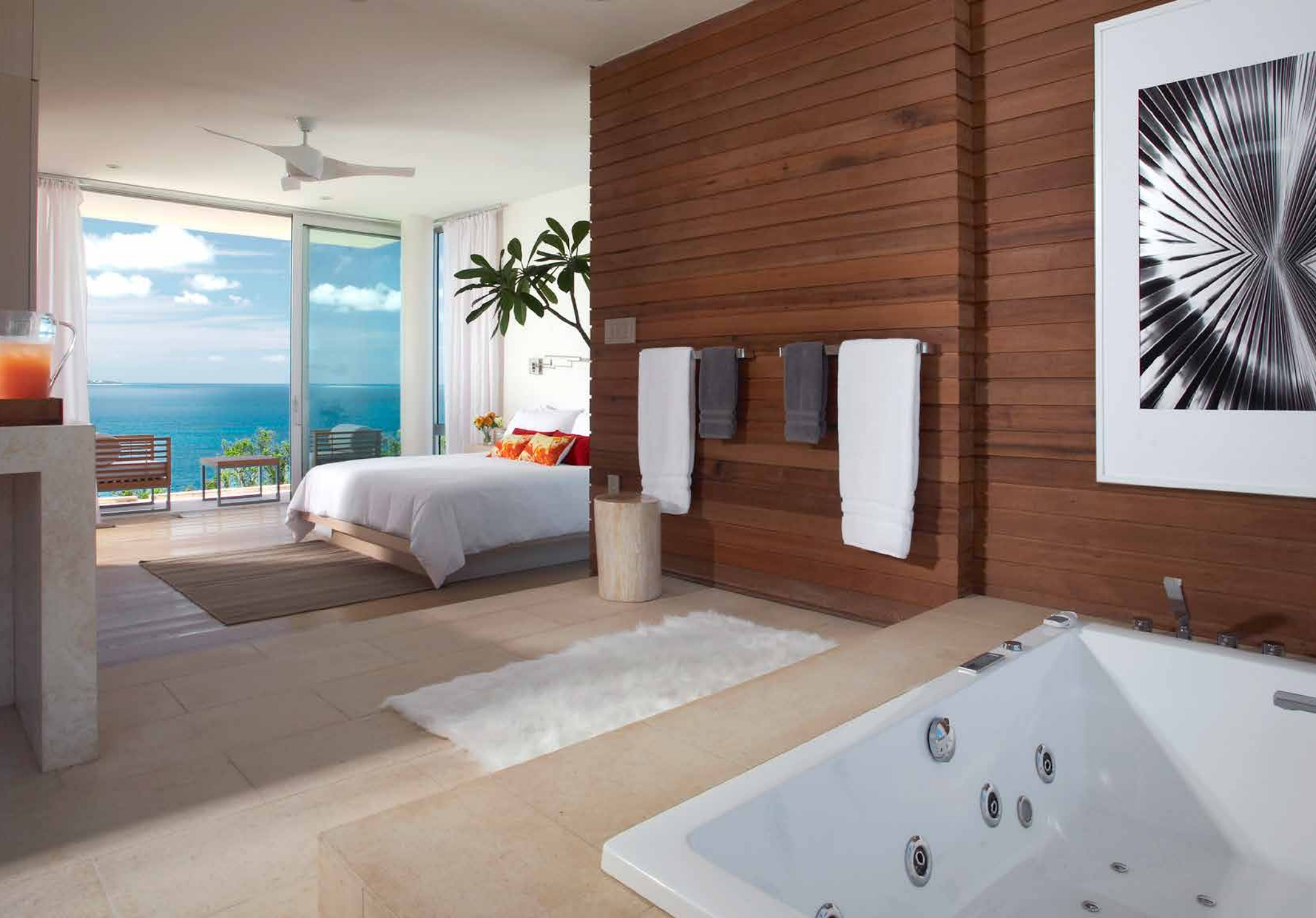
MASTER SUITE (46m 2 )