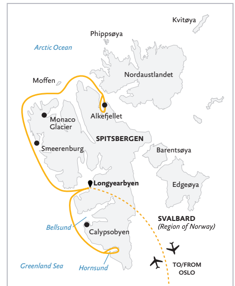
INTRODUCTION TO SPITSBERGEN: Fjords, Glaciers and Wildlife of Svalbard Onboard the Ultramarine ——— Flights to/from Oslo - - - -

Each expedition presents new opportunities and different weather and ice, so there is no fixed itinerary; however, some of the places we may visit include the 14th of July Glacier, Smeerenburg, Alkefjellet and the Hinlopen Strait. The destinations visited will be selected for optimum wildlife viewing with an appreciation of the history and geology of Spitsbergen.